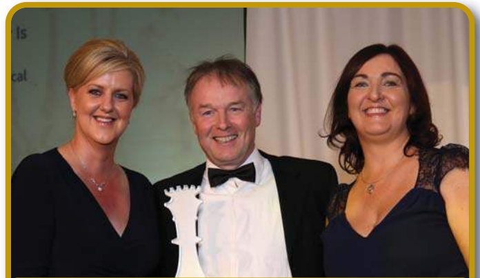
Meditec Medical - International Trade Award, sponsored by Kuehne + Nagel