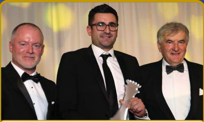
Molloys Liquor Store Tallaght, joint winners of the Customer Service – Retail Award, sponsored by Citywest Hotel