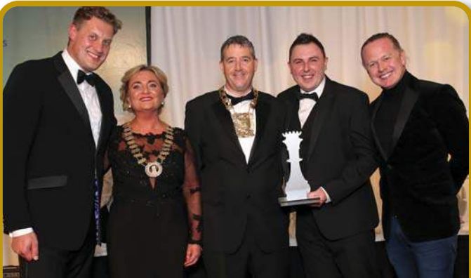
Wilson's Auctions - Business Sustainability Award, sponsored by Google Ireland,