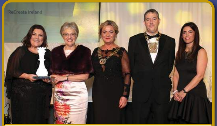
ReCreate Ireland - Best Not-For-Profit Organisation, sponsored by Bewley's