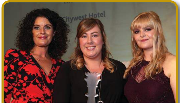
The Woodlock Brasserie - Best Place to Eat Award, sponsored by OGX Group