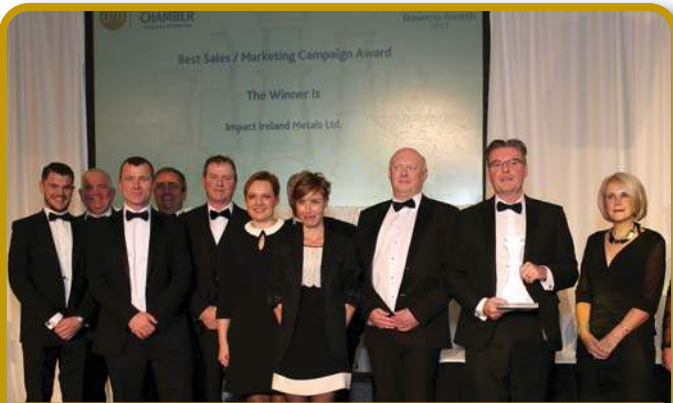
Impact Ireland Metals Ltd - Best Sales/Marketing Campaign Award, sponsored by Noel Group