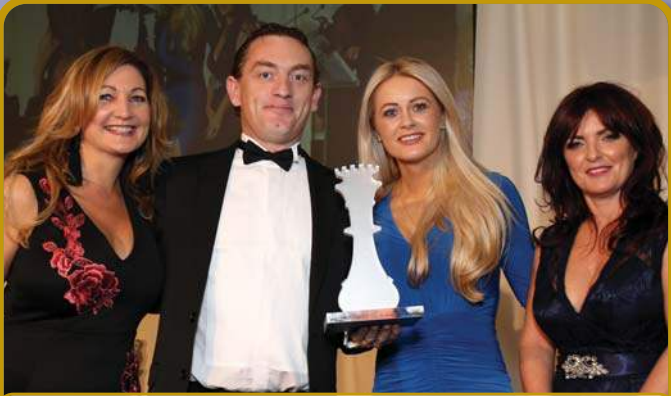
Red Cow Moran Hotel - Customer Service – Tourism & Hospitality Award, sponsored by Punctual Print