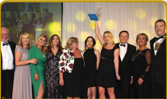
The Echo Newspaper - Innovation in Business Awards, sponsored by Egis Projects Ireland