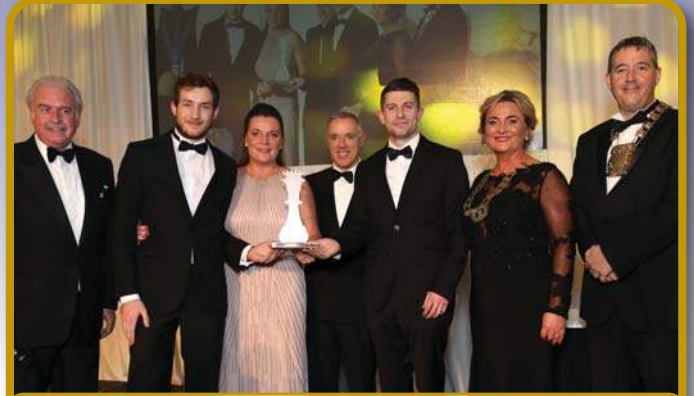
Super Disty - Best Start-up/New Business, sponsored by EQuita Consulting