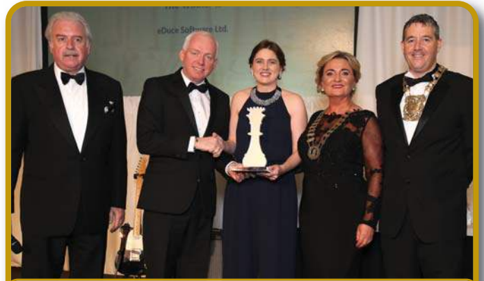
eDuce Software Ltd, - Best Small Business Award, sponsored by AIB