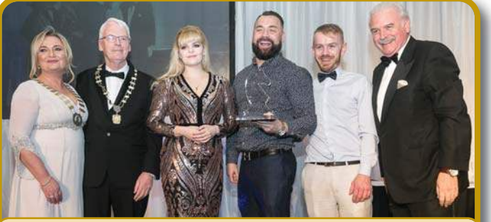
Peachtree East, winners of the Best Place to Eat Award, sponsored by OGX Group