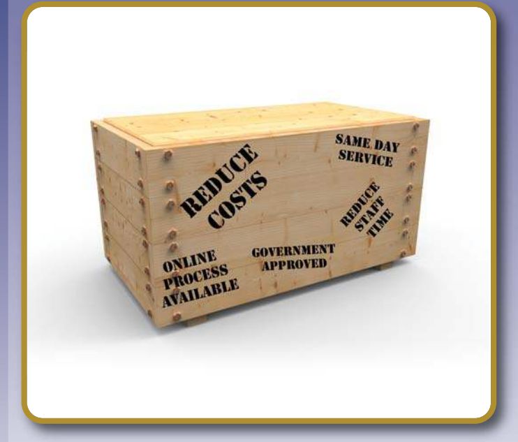
If you are an Exporter are you aware that South Dublin Chamber is the Approved Government Certification Office in your area.

Some countries require a Certificate of Origin with imports. An authorised Certificate of Origin provides this proof, South Dublin Chamber is authorised by the Department of Business, Enterprise & Innovation to issue Certificates of Origin. The type of Certificate required varies according to the destination of the goods e.g. member States of the Arab League require an Arab-Irish Certificate of Origin. European Union countries require a European Union Certificate of Origin (EU Certificate).