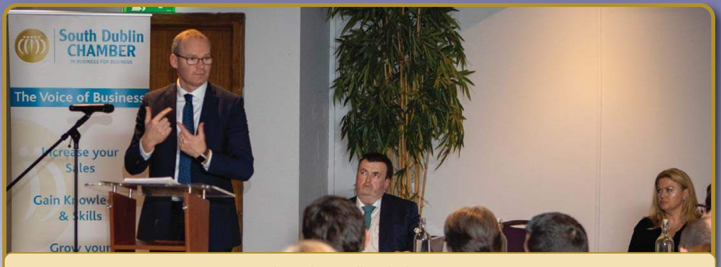
Tánaiste and Minister for Foreign Affairs and Trade, Simon Coveney, T.D.

On the 12th February Tánaiste and Minister for Foreign Affairs and Trade TD, Simon Coveney addressed Chamber members at our Brexit Insight event in the Maldron Hotel Tallaght. The evening event was well attended with over 100 businesses represented, ranging from some of our biggest members to some of the smallest. The size and diversity of businesses in attendance was a clear illustration of the widespread cross sectoral impact of Brexit.