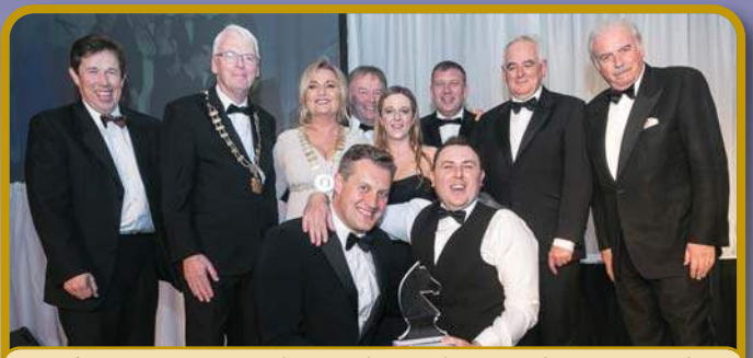
Wilsons Auctions, winners of Best Family-Owned & Managed Businesses Award, sponsored by Crowe