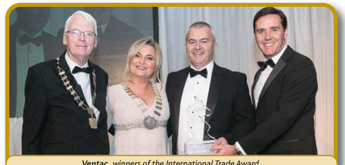
Ventac, winners of the International Trade Award, sponsored by Easytrip.ie